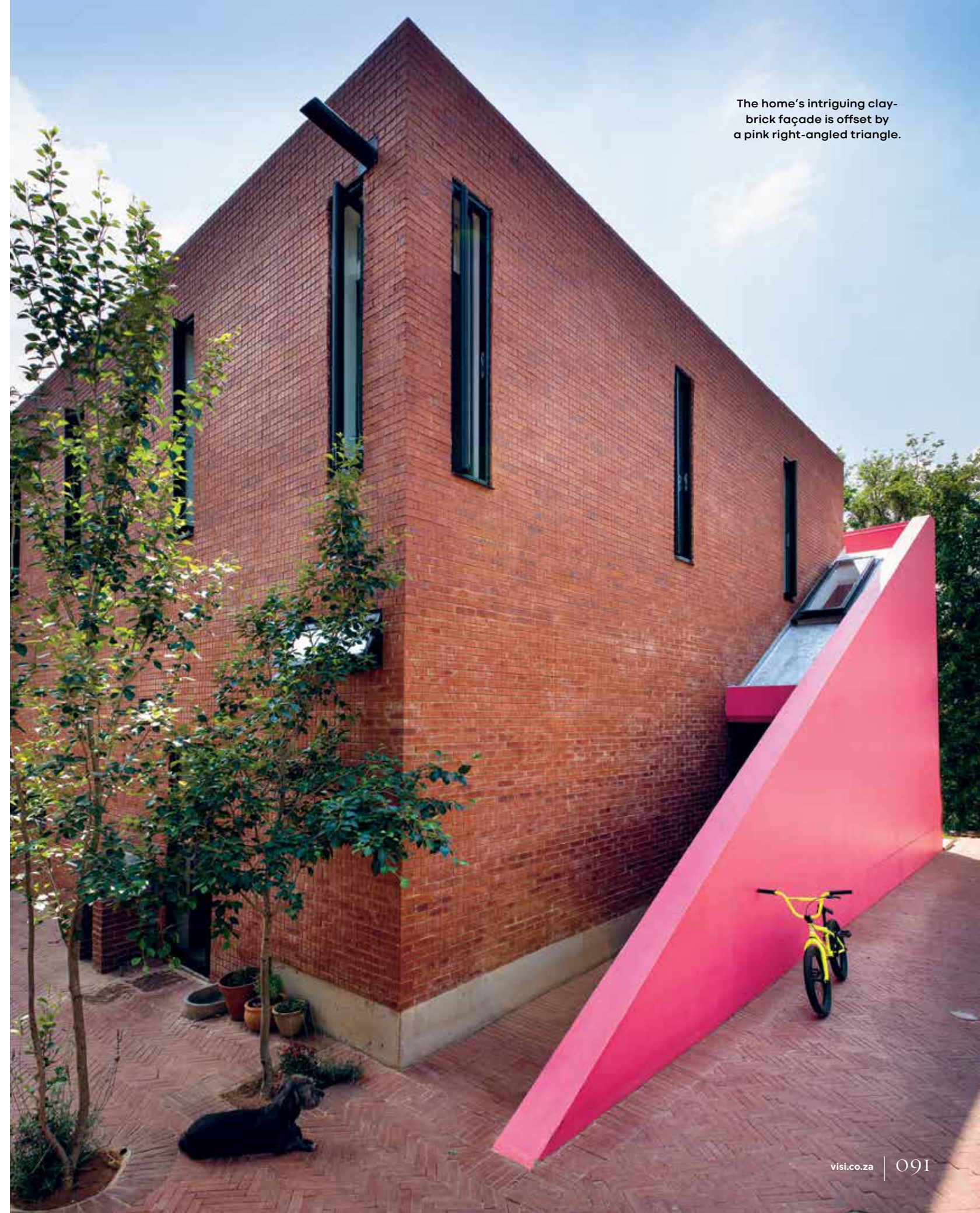
The home's intriguing clay-brick façade is offset by a pink right-angled triangle.

At the top of a leafy street sits a remarkably fresh and bold contemporary home, untamed and unburdened by a need to colour within the lines.