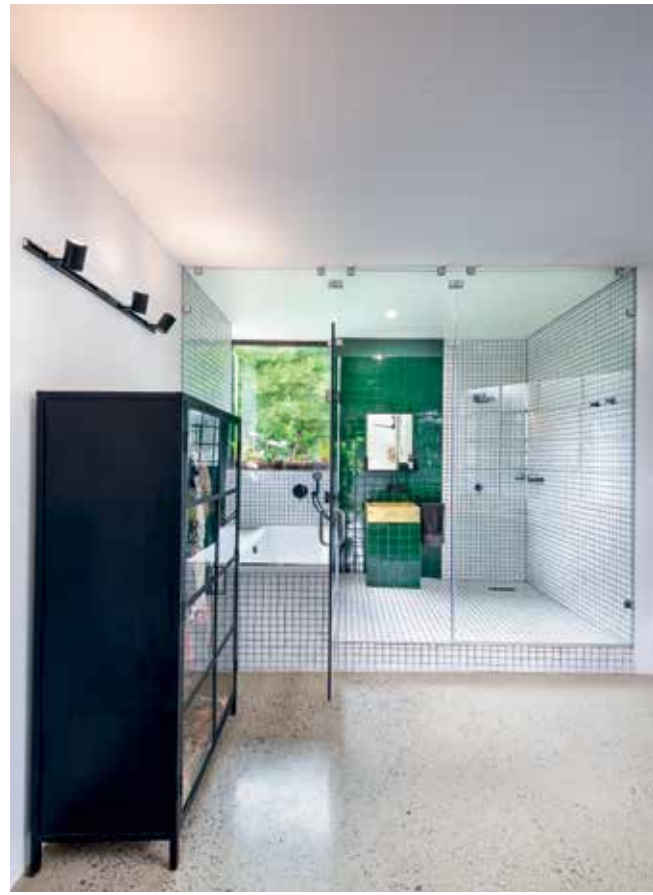
CLOCKWISE FROM ABOVE The client's green thumb is a prevalent motif throughout the home. Above the balustrade is the beginning of an indoor vertical garden, reaching up to the sunlight that filters down from the skylight; a window set above the bathtub frames a view of an old oak tree, introducing texture and tranquillity into this glass box; there is a consistency in the inconsistent positioning and scale of the window openings. OPPOSITE The monolithic cube with irregular geometric cutouts gives the house a stately edge.